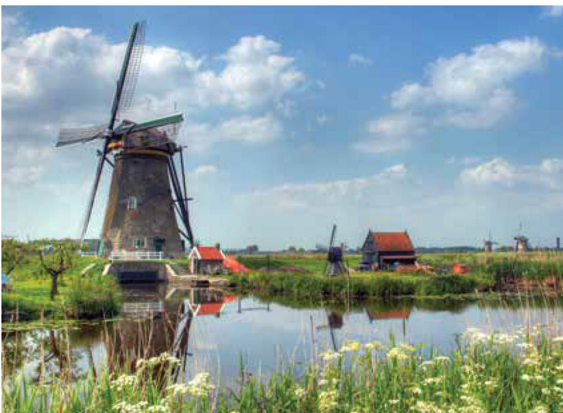
Kinderdijk, The Netherlands

From Helsinki to Copenhagen, cruise past medieval spires and Baroque and Art Nouveau buildings on this discovery of Baltic and Scandinavian nations. Highlights include an overnight call in Stockholm, a private concert in Tallinn, Estonia and an optional excursion to Vilnius, Lithuania. Optional Helsinki or St. Petersburg prelude and Copenhagen postlude. Cruise rates from $8,999