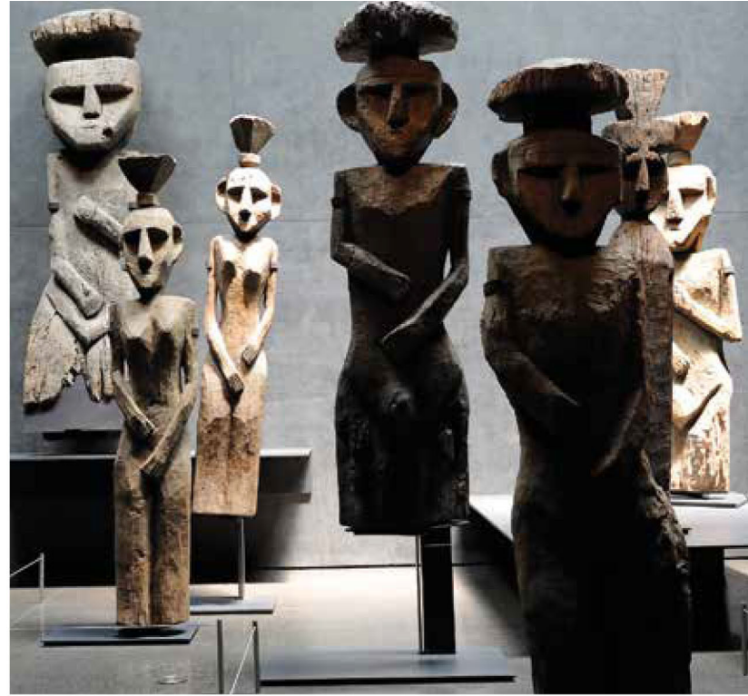
Pre-Columbian Art Museum, Santiago

Savor the stunning scenery, unique flora and fauna, and amazing artifacts of Chile. Begin in Santiago with a private visit to the Pre-Columbian Art Museum. In Valparaíso, tour the former residence of poet Pablo Neruda. Discover the world's highest altitude desert in Atacama and sample regional vintages in the Maipo Valley. Optional Easter Island prelude. Land rate $9,499