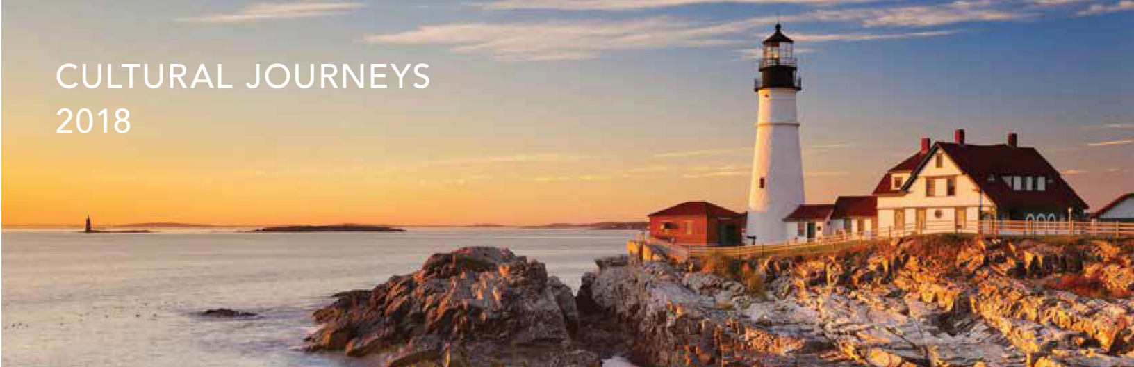
Casco Bay, Maine