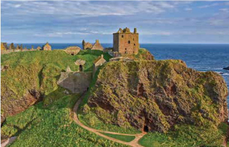
Dunnotar Castle, Aberdeen, Scotland

Please send me more information on the 2018 & 2019 trip(s) checked below.